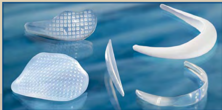
Elevate patient satisfaction with Implantech

Implantech ® Superior Patient Aesthetics 800.733.0833 | implantech.com